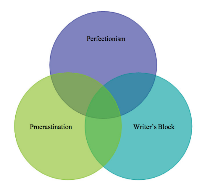
Fig. 1: Perfectionism motivates some procrastination and some writer's block

I was surprised to find that most studies on procrastination do not mention writer's block at all. On the other hand, I state that there is a connection between the two, if only because the writing itself is postponed, if not put off altogether. The fear of failure described by Ferrari is reminiscent of the frequently stated fear of the empty page experienced by the blocked writer. He or she struggles with the idea that their writing, from the first sentence, has to be no less than perfect. Therefore I am inclined to think that some procrastination is motivated by the same cause as some writer's block: perfectionism (Fig. 1).